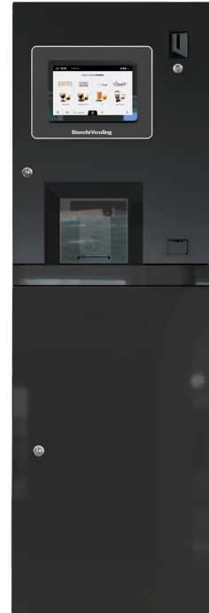
DAILY S + cabinet